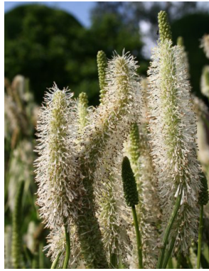
Sanguisorba canadensis beautiful tall spires of white flowers in late summer lovely foliage