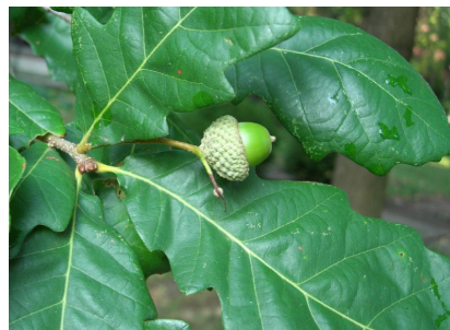
Quercus bicolor very high wildlife value striking form