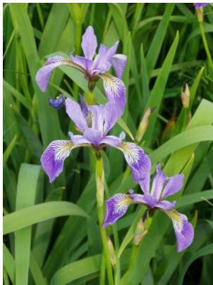
Iris versicolor late spring flower clump forming very tough