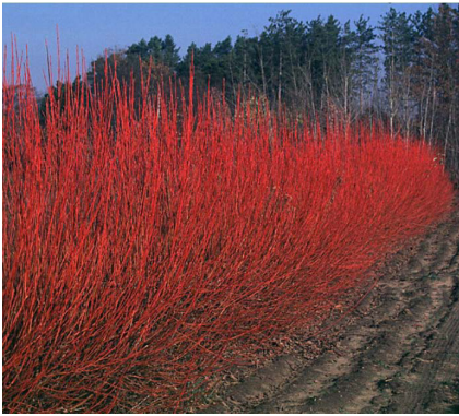
Cornus sericea 'Cardinal' red stems in winter blue fruit in summer for birds

These plants are native to our region and were chosen for their adaptation to wet soils. Some cultivars were selected to maximize color, texture, and height variance throughout the year. Weed suppression is achieved primarily by the aggressive ground cover (Senecio aureus).