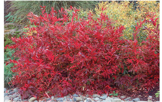
Itea virginiana showy white flowers in summer gorgeous fall color