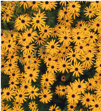
Rudbeckia fulgida 'Fulgida'

showy and self sowing loves heat and great drainage