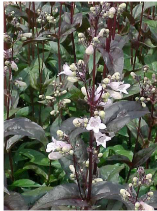
Penstemon digitalis 'Husker Red'

tall, bluish, upright grass ornamental seed heads in late summer tawny color and texture through winter creates rustling sound in wind