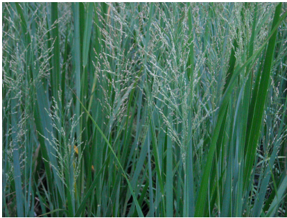
Panicum virgatum 'North Wind'

These plants are native to our region and were chosen for their drought, heat, and urban soil tolerance. Cultivars were selected to maximize color, texture, and height variance throughout the year. Weed suppression is achieved by the aggressive ground cover (Senecio aureus).